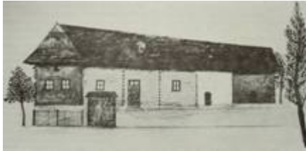
PICTURE: Exposition of the Museum of Ján Kollár

Over the entrance to the site, where the house of Ján Kollár's birth once used to be, shines his famous statement: „ Slávme slávne slávu Slávov slávnych “ (Let's splendidly celebrate the glory of glorious Slavs – picture below)