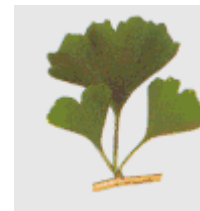
PICTURE: Ginkgo biloba

A curiosity in our nature is a specimen of the ginkgo biloba tree (for twig and leaves see the picture on the left). It's an antique species, belonging to coniferous trees, whose leaves turn yellow each autumn and fall off. It has been growing on Earth since the Mesozoic period, which means it's been around for more than 200 million years. The scientists were long convinced that it had become extinct millions of years ago, but in the 17th century they found entire forests of ginkgo in the Chinese province Tsche-Tschjang. Now it's used as a decorative tree all around the world, because it is resistant to pollution and doesn't suffer from